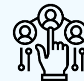
HR & Employee Operations