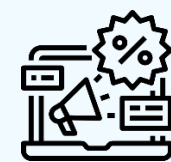
Marketing & Sales