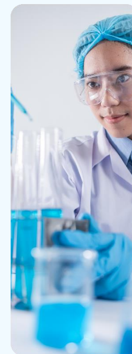
Cross - Industry